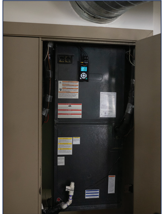
In this study, the load analysis was conducted using the AEMC® Instruments PEL 52. To secure the device in place during the week-long testing period, two powerful magnets on the casing allow it to be easily attached to the flat metallic surface of the HVAC system.

With the example above, let's conduct an energy load study on the HVAC system for a multi-family dwelling. It involves analyzing the energy consumption and load profile of the current system. This study helps to understand the energy requirements and efficiency of the air handler, or furnace unit, and the outside condenser. It can provide insights into optimizing energy usage and reducing costs.